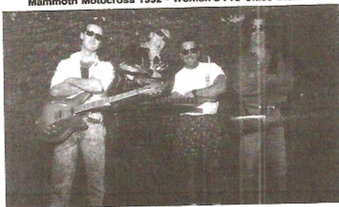
92' Women's West Coast MX Championships Band: Honk Bobo & the Undergarments.